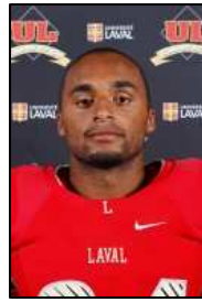
# 84 Artchill Monney